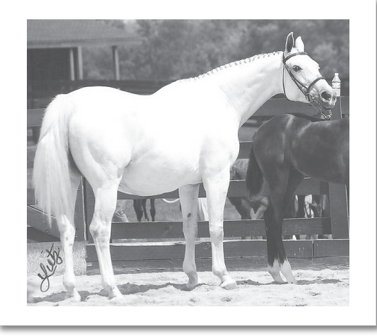
Diva, a Duellglanz mare who has made it big in both Oldenburg and Hanoverian breeding circles

Duellglanz entered stud as a 3-year-old in 1987, and before long, breeding became